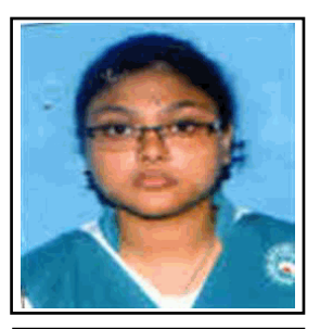
· Dryasha sur